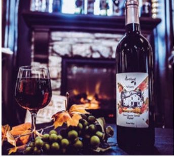
Northleaf Winery @Nicodemas Nimmo

Find more shopping and dining at visitmilton.com.