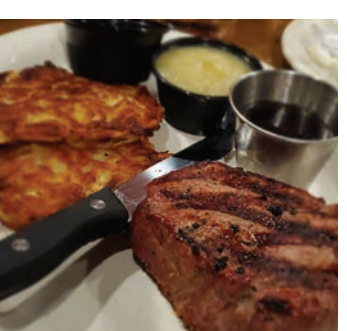
Frederick's Supper Club