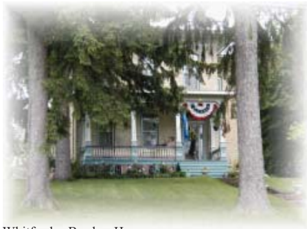
Whitford - Borden House