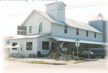
The Old Junction Mill