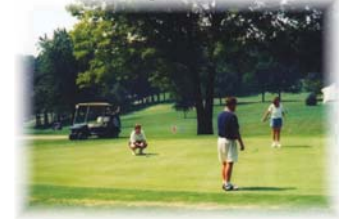
Oak Ridge Golf Course