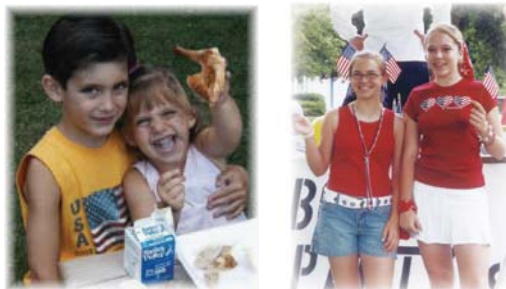
LEFT: Chicken BBQ / Arts & Crafts on the Lawn RIGHT: Fourth of July

Twilight Tours of Milton House - Third Saturday. Call (608) 868-7772 or email miltonhouse@miltonhouse.org for more information.