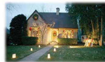
Christmas Walk & Historic Home Tour

Milton Historic Christmas Walk - Visit decorated historic homes, enjoy city wide activities. MACC sponsored. For further information on date and times, call (608) 868-6222.