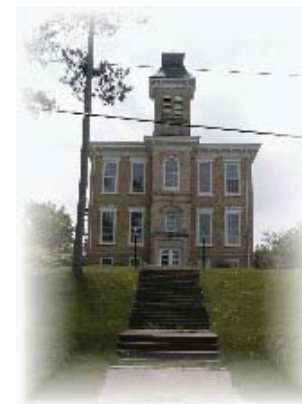
Main Hall Museum