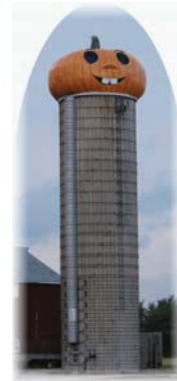
Meyer's Farm Market