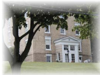
Goodrich Hall Antiques

St. Mary Catholic Church 837 Parkview Dr. 608-868-3338